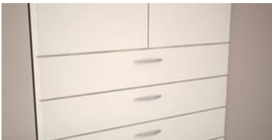
Overlay front drawer

For drawers behind doors, a white plastic spacer (distance block) is integrated. This type of drawer is suitable for all overlay hinged and mirror doors, except for glass doors.