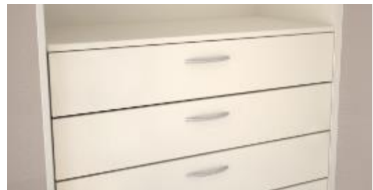
Inset front drawer